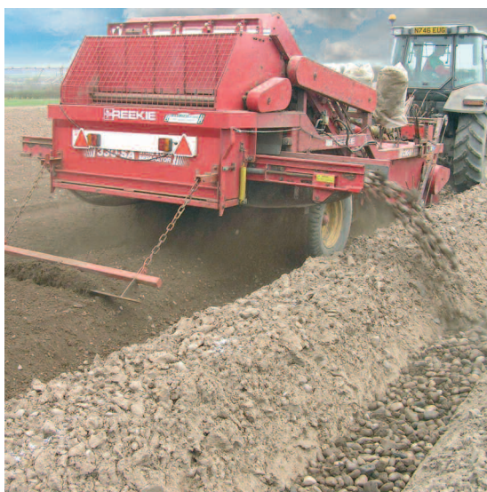
Preparing potato beds.

Based on recent fertiliser prices (June 2008) i.e. 110p/kg P 2 O 5 and 60p/kg K 2 O the typical fertiliser replacement value of green compost is £7-8/tonne and around £10/tonne for food included compost. The price of inorganic fertilisers is likely to remain high for the foreseeable future.