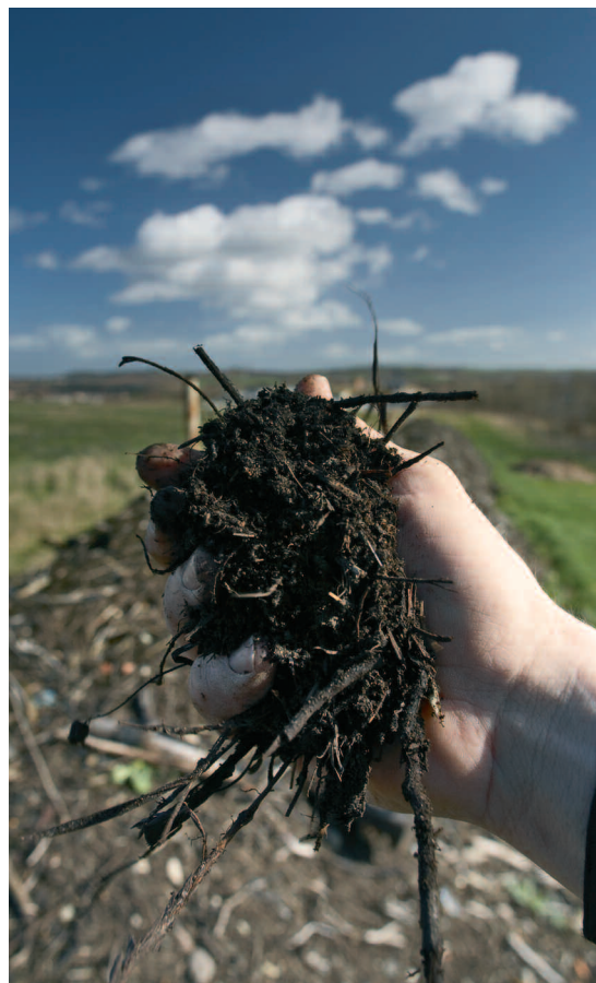
Composting in progress.