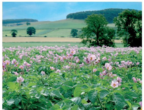
A flowering field.

Regular use of compost will help to maintain and enhance soil organic matter levels and will be of particular value for potatoes grown on lighter soils where irrigation availability is limited.