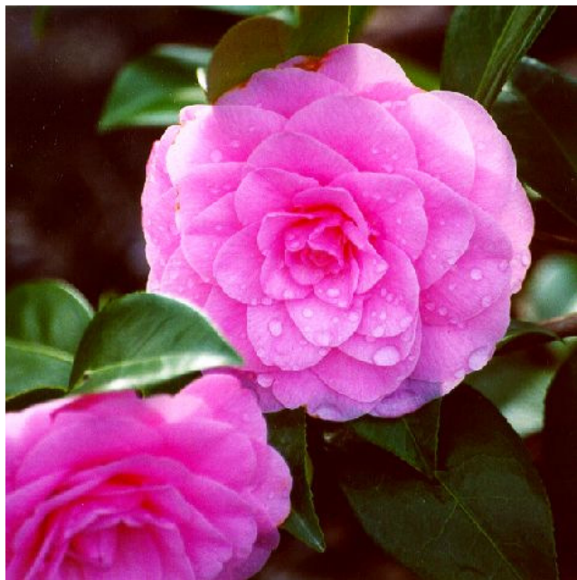
Camellia Japonica – Betty Ridley

Whilst varieties are continually tested, only those superior in form, colour or general excellence will be listed.