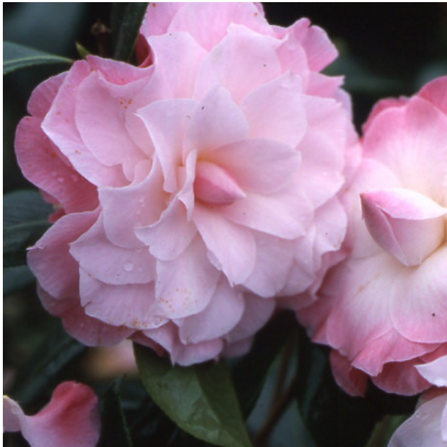
Camellia Japonica – Buttons 'N Bows

Medium size INFORMAL DOUBLE. Pale primrose yellow petaloids surrounded by antique white petals. First flowers may be pink. Compact upright growth. MID-APRIL to EARLY SEPTEMBER.