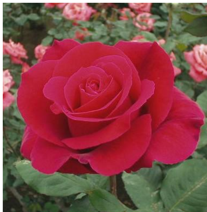
Rosa Mister Lincoln

Roses can be grown in a variety of soils with good results. In sandy soils, drainage is usually good but drying out and leaching of nutrients is a problem. Frequent watering and regular fertilising can compensate for this. Mulching at regular intervals with well-rotted matter, eg: MUSHROOM COMPOST will improve moisture-holding capacity and nutrient retention. Clay soils hold moisture well but because of the fine structure are poorly aerated and drained. The addition of well-rotted organic matter or compost will lighten a heavy soil and improve aeration and drainage. Drainage can be further improved by raising soil beds and digging in GYPSUM . A medium loam is ideal soil for roses- a combination of sand and clay particles to give a well- drained and well-aerated soil with good moisture retention. We cannot over-emphasise the value of compost in soil preparation. Remember to prune new roses before planting.