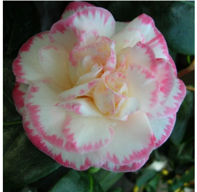
Camellia Japonica – Margaret Davis

Large SEMI-DOUBLE. Soft pink petals surrounding prominent bunch of golden stamens. Vigorous, upright habit. MID-MAY to MID-SEPTEMBER.