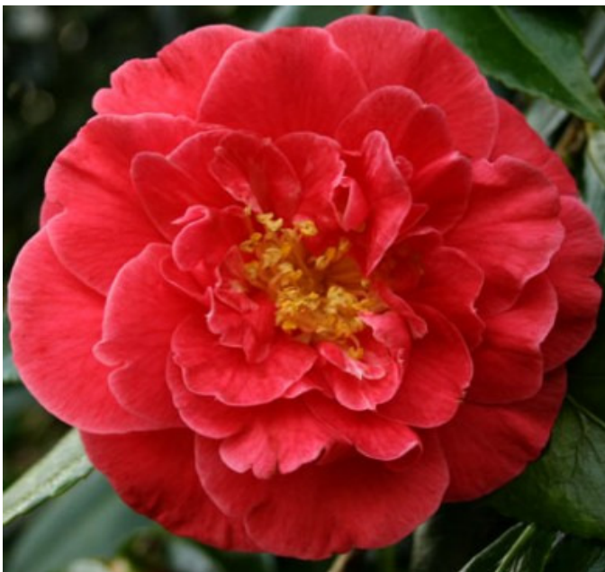
Camellia Japonica – Guilio Nuccio

Whilst varieties are continually tested, only those superior in form, colour or general excellence will be listed.